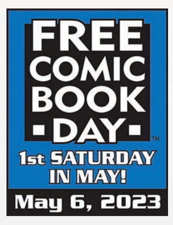
All ages. Visit the Library to receive a free comic book and bookmark of your choice. While supplies last.

Pick up a Tiny Art Show kit from the Library (while supplies last), create your masterpiece, and submit your artwork to the User Services Desk by Sunday, April 23. One entry per person, all ages welcome. Everyone is invited to a reception at 2:00 p.m. on Saturday, April 29.