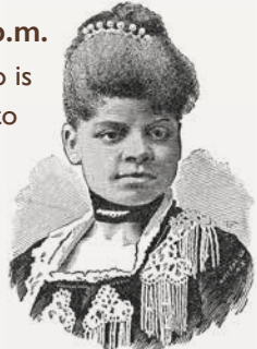
1891 Portrait of Ida B. Wells