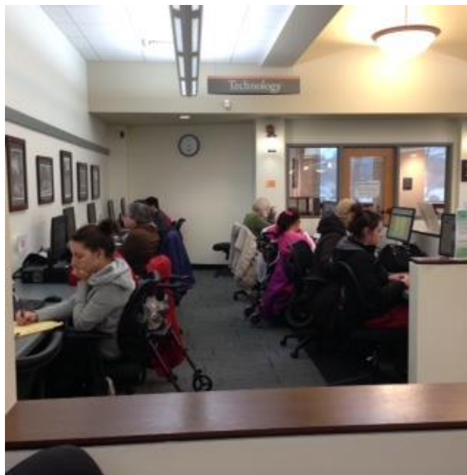
The main technology access area of the Library