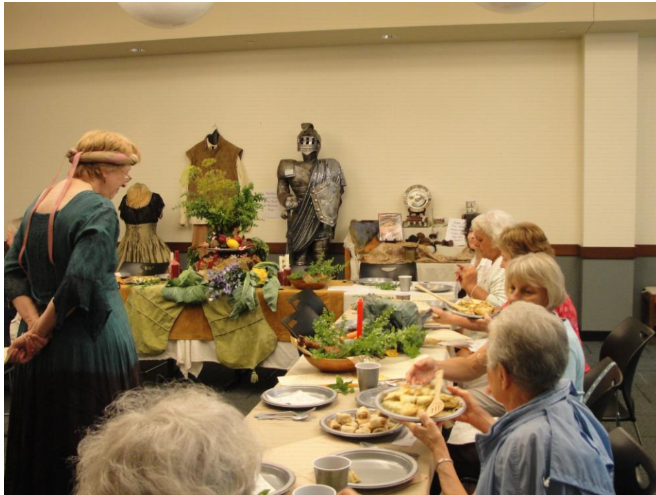
The 2014 Shakespeare and Food Program.