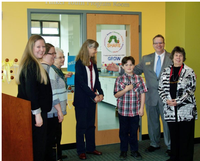
The Barbara Messenger Tinker Program Room Dedication April 12, 2015