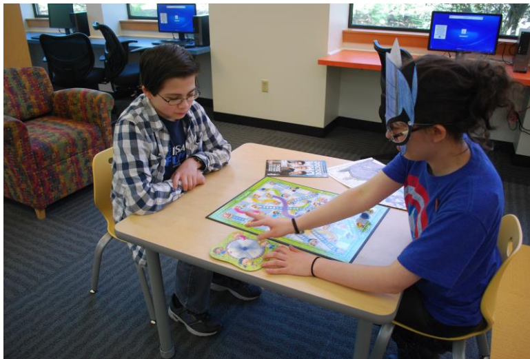
The 2015 Geek Fest Program.