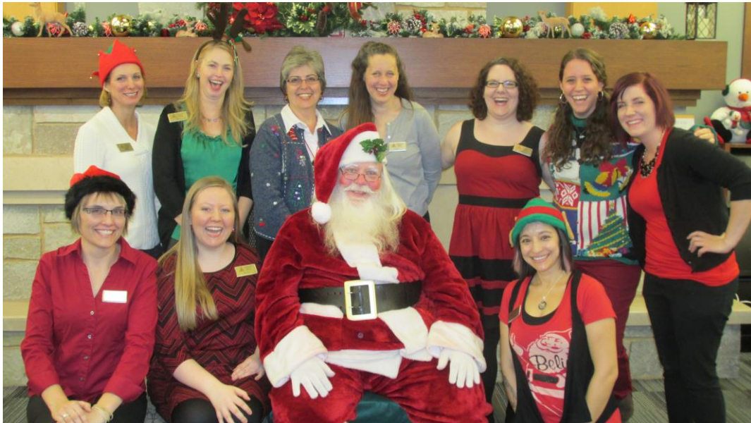
The Library Staff at the 2015 Annual Community Holiday Open House